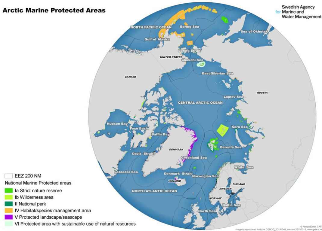
Arctic Marine Protected Areas

Swedish Agency for Marine and Water Management